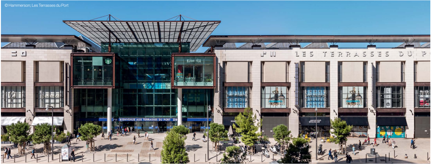
Shoppingmall Marseille, France